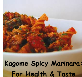
Kagome Spicy Marinara: For Health & Taste