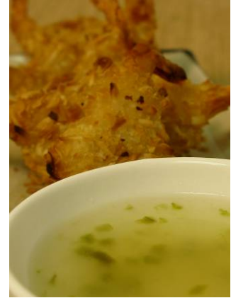
Thai Ginger Lime